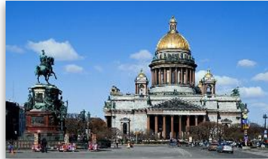
St. Petersburg, July 1 - 8, 2017