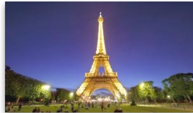
Paris, July 8 - 15, 2017