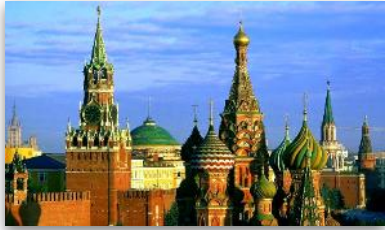
Moscow, June 24 - July 1, 2017